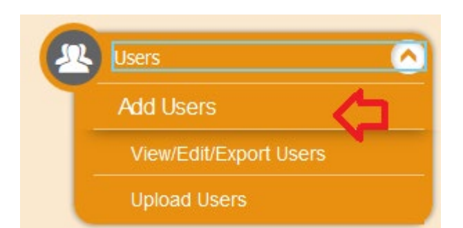
Figure 6. Fields in the Add Users Page