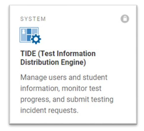
Figure 3. TIDE Card

4. Click TIDE (see <u>Figure 3</u>). The Login page appears.